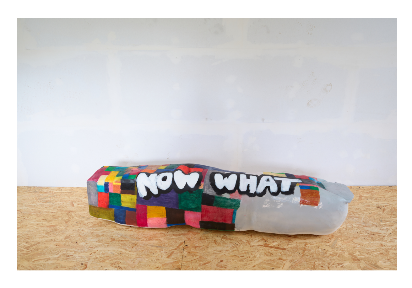
untitled (it could have been worse) 2023

40 x 175 x 40 cm cardboard, plastic's, plaster, pastel chalk, acrylic, clear varnish